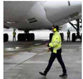
Airport ground handling