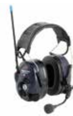
3M™ PELTOR™ WS™ LiteCom Plus