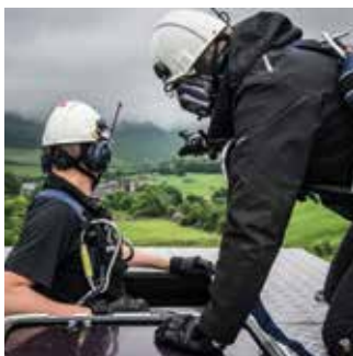
Energy and utilities