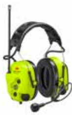
3M™ PELTOR™ LiteCom Plus