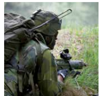
Military and law enforcement