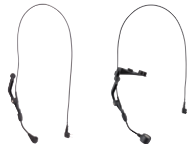
3M™ PELTOR™ MT53V/1 (ELECTRET) LiteCom