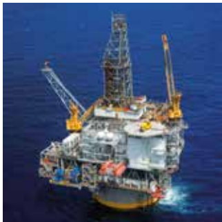
Oil and gas

To ensure easy use of our products and good functions for all environments we use advance technology such as Level Dependent technology and Bluetooth®.