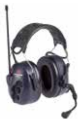
3M™ PELTOR™ LiteCom