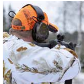
Hunting and sport shooting